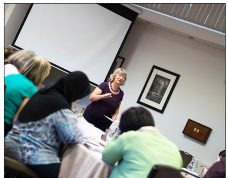
Right: The 'Speedwriting' workshop provided by CAROD.

A weekly email will list the courses that are available for the following two weeks. A list of all the term's courses, course descriptions and details are available on the Training Course Booking System ( www.durham.ac.uk/training.course ). We recommend that you regularly check this for revisions to the published programme and details of any additions.