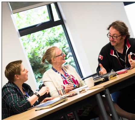
A discussion at the 'Unconscious Bias' workshop (part of the Equality and Diversity programme).

Contact the Researcher Development Team if you have any questions about the content or process of the course or are not sure whether the course would be appropriate for your needs.